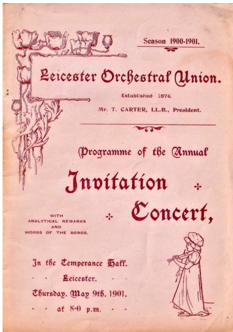
1901 Programme cover