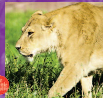
The Little Theatre Leicester

And music from films and TV – Jaws, Harry Potter, Born Free, Paddington